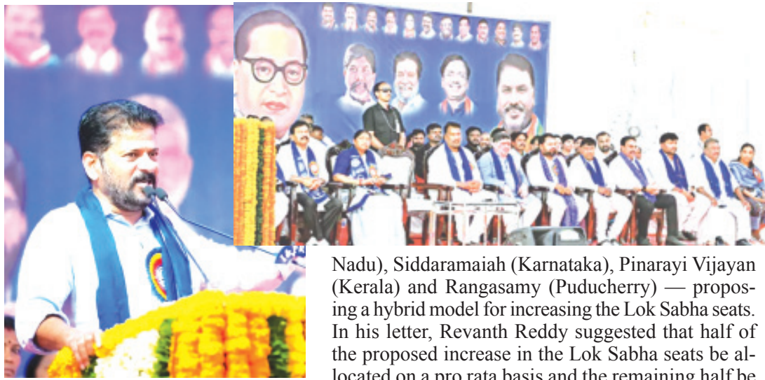
Hyderabad: Chief Minister A. Revanth Reddy on Tuesday wrote separate letters to Prime Minister Narendra Modi and five Chief Ministers from southern India — N. Chandrababu Naidu (Andhra Pradesh), M.K. Stalin (Tamil

Nadu), Siddaramaiah (Karnataka), Pinarayi Vijayan (Kerala) and Rangasamy (Puducherry) — proposing a hybrid model for increasing the Lok Sabha seats. In his letter, Revanth Reddy suggested that half of the proposed increase in the Lok Sabha seats be allocated on a pro rata basis and the remaining half be allotted based on the economic contribution of states, such as Gross State Domestic Product (GSDP) and other performance indicators. In his letter to the Prime Minister, Revanth Reddy urged the Centre to build a national political consensus on the proposed increase in Lok Sabha seats, while separating the issues of