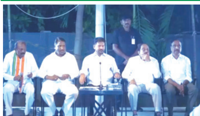
Chief Minister A. Revanth Reddy held a crucial meeting with senior leaders and party functionaries here on Tuesday to boost the