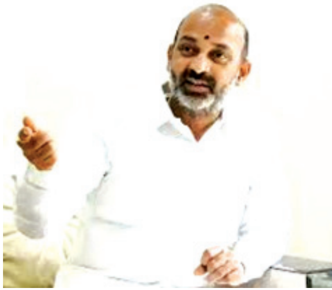
Hyderabad: Union Minister of State for Home Affairs Bandi Sanjay Kumar on Sunday, May 3, wrote to Telangana Chief Minister A Revanth Reddy, accusing state Agriculture

Minister Tummula Nageshwara Rao of misleading farmers and deflecting attention from the Congress government's unfulfilled election promises. In the letter, Bandi Sanjay said that while Congress had promised a complete loan waiver for farmers who had borrowed up to Rs 2 lakh, the state government's own figures showed only 25 lakh of an estimated 45 lakh eligible farmers had received relief, leaving nearly 20 lakh farmers without the promised benefit. Taking aim at Tummula Rao's claim that minimum support price (MSP) legislation was within the state's purview, the Bharatiya Janata Party (BJP) leader said fixing MSP was a central subject and that the state government could not shed its own responsibility by pointing fingers at the Centre. He noted